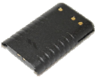
FNB-V103Li Li Ion 1150mAh AAG40X001