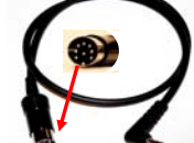
CT-106 (used with USB interface) Programming VX-160, 231, 350 series, 410/420 series Flashing firmware VX-231 AAD68X001