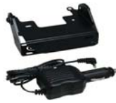
Vehicle Charger Mounting Adapter AAF15X001 VCM-2 for VAC-300