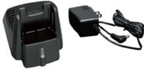
VAC-300 Charges FNB-V95/-V96LI Li Ion GMLN5024A (VAC-300C Euro plug) GMLN5023A (VAC-300U UK plug)