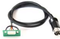
CT-124B (used with USB interface) Lead used with FIF-10A for Firmware updating of VX-820 series, VX-920 series AAF26X002