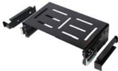
MMB-85 Mobile mounting bracket AAD48X001 VX-4100E, VX-4200E

VX-2100E, VX-2200E, VX-4100E, VX4200E and VX-5500