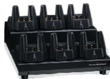
VAC-6020 6-way Multi Unit Charger NiMH GMLN5067A (VAC-6020C MUC for FNB-V106 NiMH 240V Euro Plug) GMLN5068A (VAC-6020U MUC for FNB-V106 NiMH 240V UK Plug)