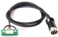
CT-124B (used with USB interface) Lead used with FIF-10A for Firmware updating of VX-350 series, VX-410/420 series AAF26X002