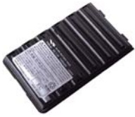
FNB-83 NiMH 1400mAh AAD65X001

Batteries and chargers for VX-160E, VX-180E, VX-414/7E, VX-424/7E