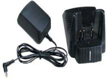
VAC-10 Charges FNB-83 & FNB-V94 NiMH GMLN5020A (UK plug) GMLN5019A (Euro plug)