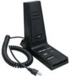
MD-12A8J Desktop Microphone AAF13X001 VX-2100E, VX-2200E VX-4100E, VX-4200E