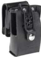
LCC-410S (for VX-414 and VX-417) Leather case + swivel belt clip AAG44X002