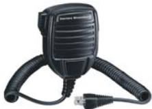
MH-67A8J Hand Microphone AAE60X102