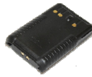
FNB-V106 NiMH 1200mAh AAG57X002