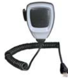
MH-53A8J Heavy duty noise cancelling microphone AAB02X008 VX-2100E, VX-2200E VX-4100E, VX-4200E