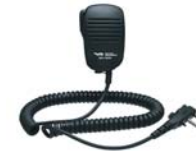
MH-360S Speaker Microphone Miniature type AAF52X001