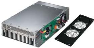
VPA-9000VC EXP 100W RF Power Amplifier for VXR-9000 VHF 148-174MHz Non CE AAE21N002