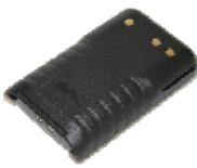
FNB-V104Li Li Ion 2000mAh AAG41X001