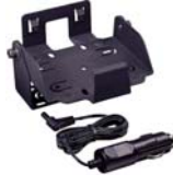
Vehicle Charger Mounting Adapter AAA72X001 VCM-1 for VAC-810 AAF23X001 VCM-3 for VAC-10