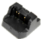
VAC-20 Charges FNB-V106 NiMH GMLN5065A (VAC-20C Euro plug) GMLN5066A (VAC-20U UK plug)