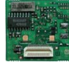
FVP-36 Inversion Encryption unit A12760003

VX-351E, VX354E VX-414E, VX-417E, VX-424E, VX-427E VX-821E, VX-824, VX-829E VX-921E, VX-924, VX-929E VX-821E, VX-824, VX-829E ATEX VX-921E, VX-924, VX-929E ATEX VX-2100,2200 VX-4100,4200 VXR-9000