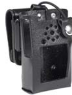
LCC-420S (for VX-424 and VX-427) Leather case + swivel belt clip AAG44X004