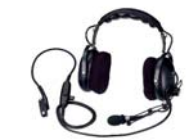
VH-111 Over the head, heavy duty headset. AAE72X001