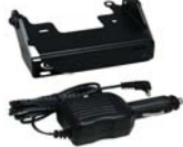
Vehicle Charger Mounting Adapter AAF15X001 VCM-2 (VAC-300 / VAC-920 / VAC-920EX)