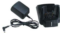
VAC-300 Charges FNB-V103/V104Li Li Ion GMLN5024A (VAC-300C Euro plug) GMLN5023A (VAC-300U UK plug)