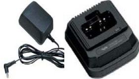
VAC-810 Charges FNB-V67Li Li Ion GMLN5034A (UK plug) GMLN5033A (Euro plug)