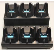
VAC-6921EX 6-way Multi Unit Charger Li Ion GMLN5051A (VAC-6921CEX Multi Unit Charger for FNB-V100LIEEX Li Ion 230-240V AC Euro plug) GMLN5052A (VAC-6921UEX Multi Unit Charger for FNB-V100LIEEX Li Ion 230-240V UK Euro plug)