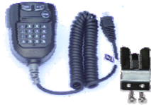
MH-77A8J IP54 keypad microphone + hang up clip AAF16X003