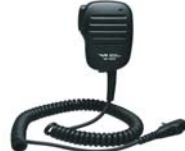
MH-450S Speaker Microphone Small type AAF53X001

Audio accessories for standard versions of the VX-821E, VX-824E, VX-829E, VX-921E, VX-924E and VX-929E radios.