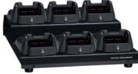
VAC-6300 6-way Multi Unit Charger Li Ion GMLN5030A (VAC-6300C MUC for FNB-V95/-V96LI Li Ion 230-240V AC Euro plug) GMLN5031A (VAC-6300U MUC for FNB-V95/-V96LI Li Ion 230-240V UK Euro plug)