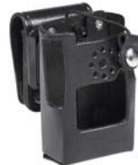
LCC-354S (for VX-354) Leather case + swivel belt clip AAG34X004