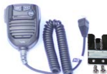
MH-77B8J IP54 microphone + hang up clip AAF16X004