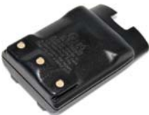
FNB-V100LIEEX Li Ion 1500mAh AAF42X001