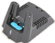
VAC-920EX Charges FNB-V100LIEEX Li Ion GMLN5049A (VAC-920CEX Euro plug) GMLN5050A (VAC-920UEX UK plug)