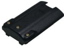
FNB-V86LI Li Ion 1150mAh AAD82X006