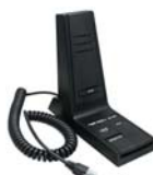
MD-12A8J Desktop Microphone AAF13X001