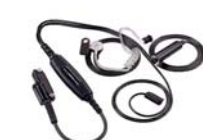
VH-121 3-wire earpiece, mic, palm PTT switch AAE21X001