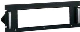
MR-3 for VXR-7000 4U high 19" wide mounting kit for VXR-7000 AAA69X001