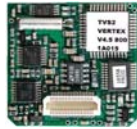
FVP-35 Rolling code Encryption unit AAF39X001

VX-351E, VX354E VX-414E, VX-417E, VX-424E, VX-427E VX-821E, VX-824, VX-829E VX-921E, VX-924, VX-929E VX-821E, VX-824, VX-829E ATEX VX-921E, VX-924, VX-929E ATEX VX-2100,2200 VX-4100,4200 VXR-9000