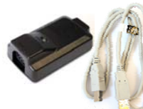
FIF-10A Kit (USB interface) USB interface (for programming and flashing firmware) AAD57X002