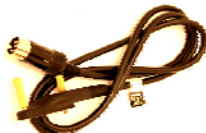
CT-108 (used with USB interface) Programming VX-820 and VX-920 series AAD92X001