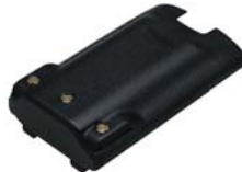
FNB-V92LI Li Ion 3000mAh AAE78X001