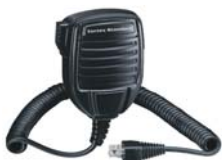
MH-67A8J Hand Microphone AAE60X102