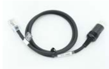
CT-104A (used with USB interface) VXR-7000 & VXR9000 series AAD66X002