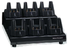
VAC-6010 6-way Multi Unit Charger NiMH GMLN5026A (VAC-6010C MUC for FNB-83/V94 NiMH 240V Euro Plug) GMLN5027A (VAC-6010U MUC for FNB-83/V94 NiMH 240V UK Plug)