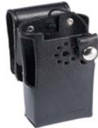
LCC-351 (for VX-231 and VX-351) Leather case + swivel belt clip AAG34X002