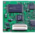
DVS-5 Digital voice storage AAD51X001

VX-414E, VX-417E, VX-424E, VX-427E VX-821E, VX-824, VX-829E VX-921E, VX-924, VX-929E VX-821E, VX-824, VX-829E ATEX VX-921E, VX-924, VX-929E ATEX VX-4100,4200