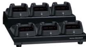
VAC-6300 6-way Multi Unit Charger Li Ion GMLN5030A (VAC-6300C MUC for FNB-V103/V104Li Li Ion 230-240V AC Euro plug) GMLN5031A (VAC-6300U MUC for FNB-V103/V104Li Li Ion 230-240V UK Euro plug)