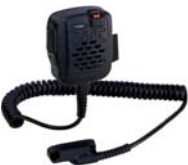
MH-50A7A (ATEX) Speaker Microphone Noise cancelling AAA75X004

Audio accessories for ATEX versions of the VX-821E, VX-824E, VX-829E, VX-921E, VX-924E and VX-929E radios.