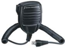
MH-67A8J Hand Microphone AAE60X102 VX-2100E, VX-2200E VX-4100E, VX-4200E

Audio accessories for VX-2100E, VX-2200E, VX-4100E, VX4200E and VX-5500