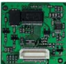
VME-100 MDC1200/GE-STAR ANI encoder only AAF41X001

VX-351E, VX354E VX-414E, VX-417E, VX-424E, VX-427E VX-821E, VX-824, VX-829E VX-921E, VX-924, VX-929E VX-821E, VX-824, VX-829E ATEX VX-921E, VX-924, VX-929E ATEX VX-2100,2200 VX-4100,4200