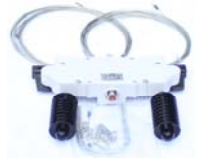
YA-31 Dipole or Wire (end fed) Type HF antenna AAF76X001

CT-81 (AAC04X001) remote mount cable 6 meters CT-82 (AAC05X001) remote mount cable 2.5 meters CT-83 (AAC06X001) remote mount cable 0.6 meters CT-84 (AAD07X001) remote mount cable 10 meters