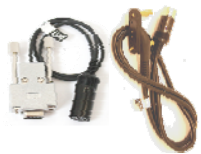
CT-109 Kit (RS-232) RS232 interface programming cable kit AAD93X001