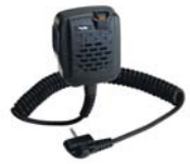
MH-45B4B Speaker Microphone Noise cancelling A13960007