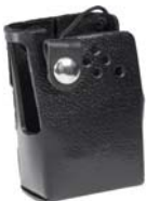
LCC-820 (for VX-821) Leather case + belt loop AAG19X001