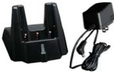
VAC-920 Charges FNB-V86/-V87/-V92LI Li Ion GMLN5022A (VAC-920C Euro plug) GMLN5021A (VAC-920U UK plug)