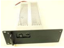
FP-31 (CE) for 25 watt VXR-9000 Internally mounted 220VAC to 240VAC + Battery management with EU plug AAC96X002