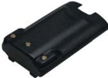
FNB-V87LI Li Ion 2000mAh AAD83X002