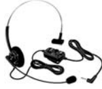
VC-25 VOX Headset (VOX gain control and PTT - VOX or PTT slider switch) A12060001