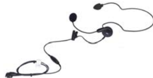
VH-115S Light weight headset w/ Boom mic AAG48X001