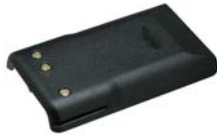
FNB-V96LI Li Ion 2000mAh AAF21X001