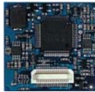
VMDE-200 MDC1200/GE-STAR ANI decoder/encoder AAF40X001

VX-351E, VX354E VX-414E, VX-417E, VX-424E, VX-427E VX-821E, VX-824, VX-829E VX-921E, VX-924, VX-929E VX-821E, VX-824, VX-829E ATEX VX-921E, VX-924, VX-929E ATEX VX-2100,2200 VX-4100,4200