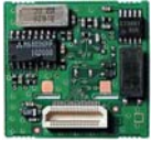
FVP-25 Encryption/DTMF Pager Unit A12760001

VX-351E, VX354E VX-414E, VX-417E, VX-424E, VX-427E VX-821E, VX-824, VX-829E VX-921E, VX-924, VX-929E VX-821E, VX-824, VX-829E ATEX VX-921E, VX-924, VX-929E ATEX VX-2100,2200 VX-4100,4200 VXR-9000