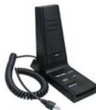
MD-12A8J Desktop Microphone AAF13X001