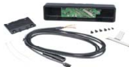
RMK-5000B Cover for RF Deck used with CNT-5000 includes CT83 AAD58X001 CNT-5000