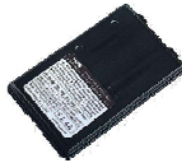
FNB-V67Li Li Ion 2000mAh AAB01X001