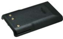
FNB-V95LI Li Ion 1800mAh AAF20X003