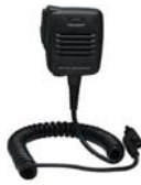
MH-66A7A (ATEX) Submersible Speaker Microphone AAE46X001