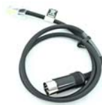
CT-126 (RS-232 interface) RS232 DB9 programming cable for VXR-9000 series.....connect to CT-29 AAF34X001