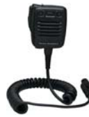
MH-66B7A (ATEX) Submersible Speaker Microphone (w/PF key, toggle) AAE46X002