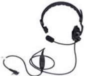
VH-215S Light weight padded headset, Single Speaker AAG49X001