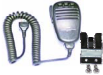
MH-31A8J Dynamic Hand Microphone + hang up clip A06870001