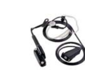
VH-131 2-wire earpiece, palm/mic PTT combo AAE74X001

Audio accessories for ATEX versions of the VX-821E, VX-824E, VX-829E, VX-921E, VX-924E and VX-929E radios.