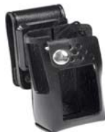
LCC-820S/TT (for VX-824 and VX-829) Leather case + swivel belt clip AAG19X006