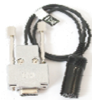
CT-29 (RS-232 interface) RS232 interface programming cable kit A08190001