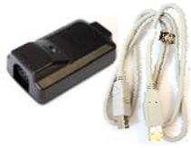
FIF-10A Kit (USB interface) USB interface (for programming and flashing firmware) AAD57X002