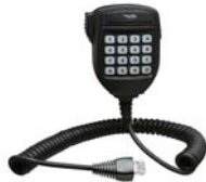
MH-75A8J Keypad microphone AAG22X101 VX-2100E, VX-2200E VX-4100E, VX-4200E