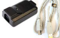
FIF-10A Kit (USB interface) USB interface (for programming and flashing firmware) AAD57X002