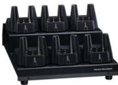
VAC-6920 6-way Multi Unit Charger Li Ion GMLN5022A (VAC-6920C Multi Unit Charger for FNB-V86/-V87/-V92LI Li Ion 230-240V AC Euro plug) GMLN5025A (VAC-6920U Multi Unit Charger for FNB-V86/-V87/-V92LI Li Ion 230-240V UK Euro plug)