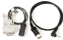
CT-42 Kit (RS-232) RS232 interface programming cable kit A09040001