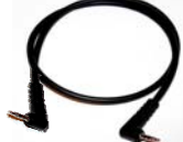
CT-27 Radio - Radio Clone Lead A08110001