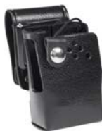
LCC-820s (for VX-821) Leather case + swivel belt clip AAG19X002