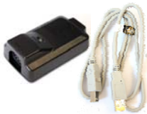
FIF-10A Kit (USB interface) USB interface (for programming and flashing firmware) AAD57X002