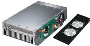
VPA-9000UD EXP 100W RF Power Amplifier for VXR-9000 UHF 450-490MHz Non CE AAE21U002