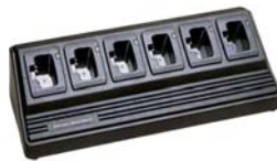
VAC-6810 6-way Multi Unit Charger Li Ion GMLN5028A (VAC-6810C MUC for FNB-V67Li Li Ion 230-240V AC Euro plug) GMLN5029A (VAC-6810U MUC for FNB-V67Li Li Ion 230-240V AC UK plug)